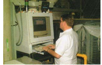
An operator controls the material handling system from the control station located next to the unloaders.

The new material handling system converted a labor-intense manual process into a simple automated process. "The new system drastically reduced the need for the operators to manually handle materials," says Svenstrup. "Now, the only manual processes the operators have to do are scan the bulk bag bar codes, operate the forklift, secure the bag in the lifting frame, open the bag's discharge spout, and use the control station to download the batch information. In addition, we cut one operator from this process because it no longer takes so much time to piece together and dispense the material."