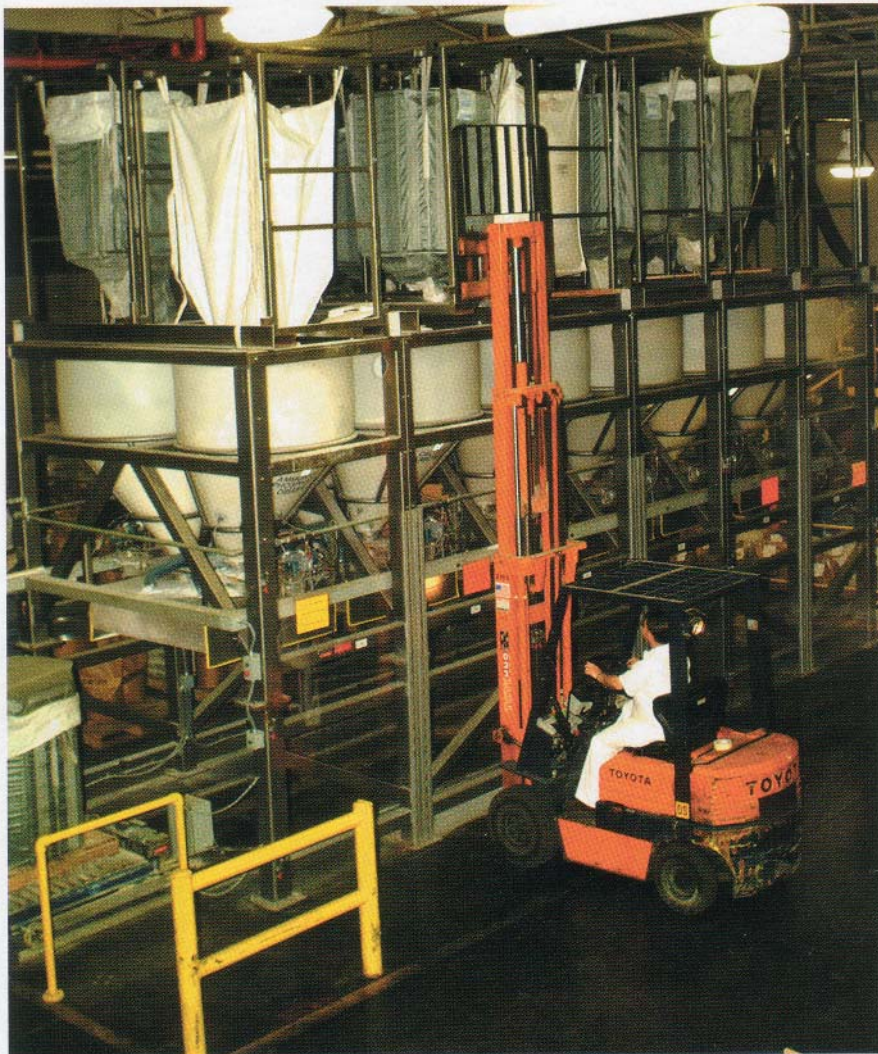
A forklift places a bag-lifting frame supporting a 2000-pound bulk bag onto an unloader's top.

Manually handling the 50-pound bags created three problems for the company. First, repeatedly lifting the bags could potentially cause injuries such as back and shoulder pain and carpal tunnel syndrome. Second, because of the time involved in